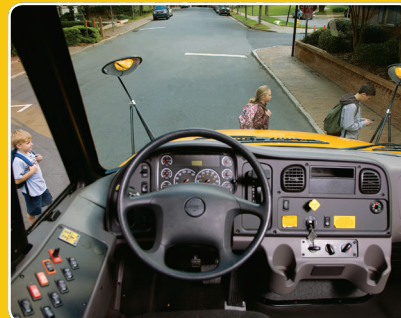
Our largest-in-class windshield increases loading zone visibility to keep your passengers safe.

* Some options only available through dealerships