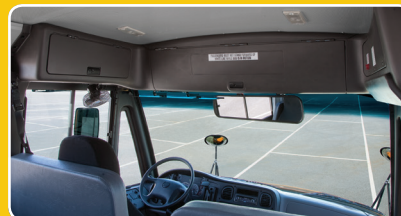
The cockpit features increased overhead storage space and improved interior rearview mirror placement.