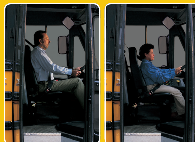
Optional tilt and telescoping steering wheel and optional adjustable pedals give drivers of all sizes the comfort they deserve.