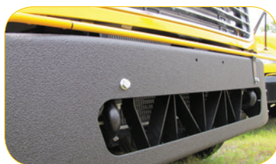
BUMPER TUFFCOAT COVERAGE