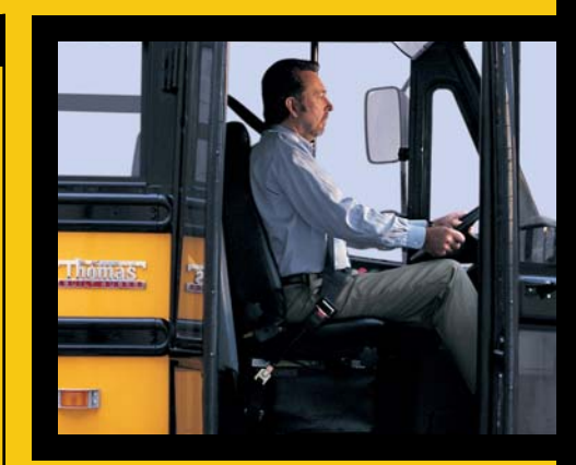
Driver is 6 feet 8 inches

Drivers come in all shapes and sizes. That's why we designed flexibility into the C2 driver environment. Some of the ergonomic innovations include easy-to-read gauges, additional legroom, optional adjustable pedals and an optional tilt and telescoping steering wheel. Plus, drivers will enjoy improved temperature controls.