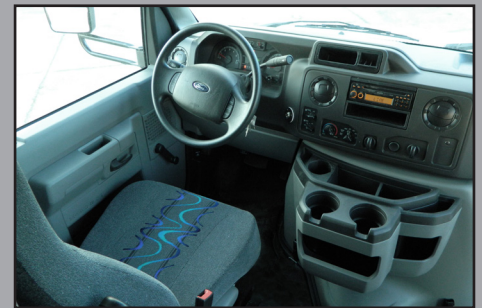
Comfortable and easily-accessible driver's area