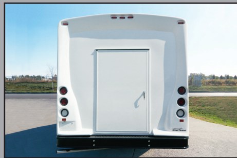
Stylish fiberglass rear cap with rear luggage access door