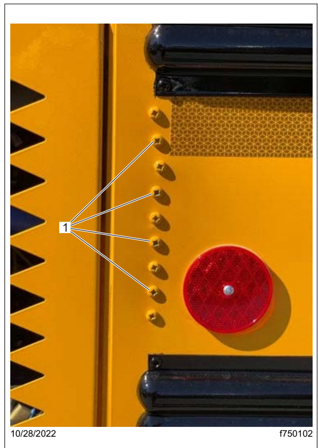
Fig. 3, Middle Rear Side Sheet Joint, Additional Screws