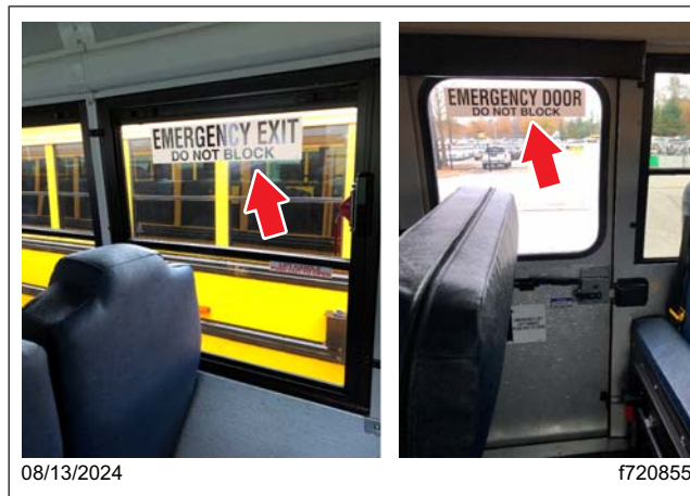
Fig. 1, Emergency Door and Window Labels