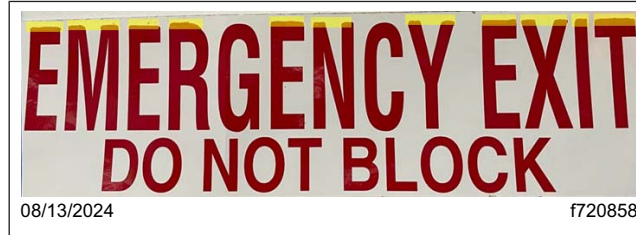
Fig. 4, Highlighted Areas Indicate Letters Needing Paint

4.2 Figure 4 shows the highlighted areas that need more paint on the letters.