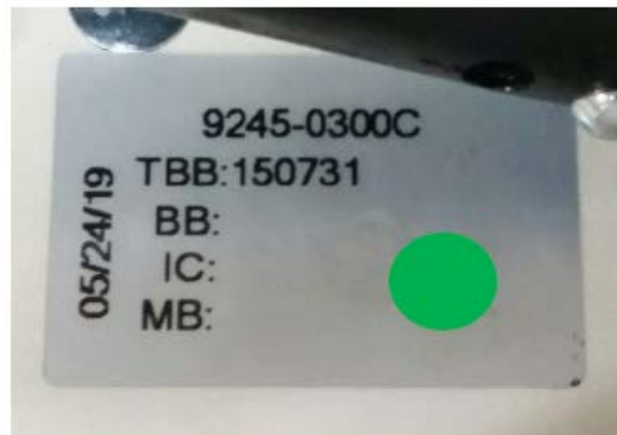
Figure 9: Green Sticker on the Data Label