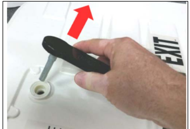
Figure 4: Removing the Exterior Hatch Handle