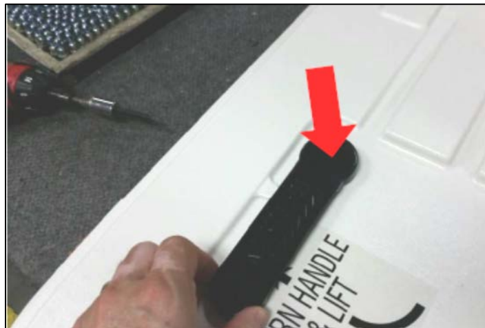
Figure 5: New Handle Inserted in the Hatch