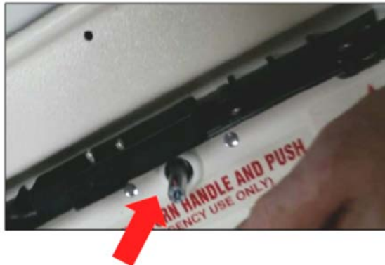
Figure 6: Handle Stem through the Interior of the Hatch