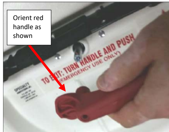
Figure 8: Installing the Red Handle on the Interior of the Hatch