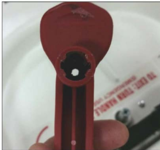
Figure 7: Ribs Inside the Red Interior Handle that Self-Orient