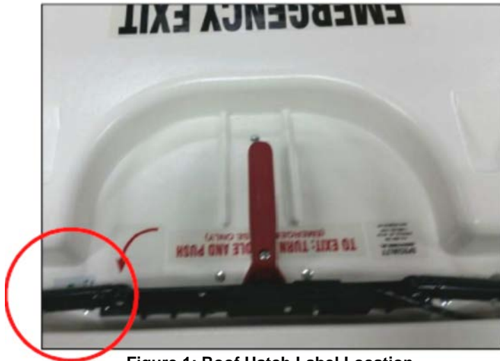
Figure 1: Roof Hatch Label Location