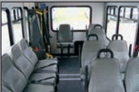
Optional wheelchair accessible floor plan with mid back seats, top mounted grab handles and armrests