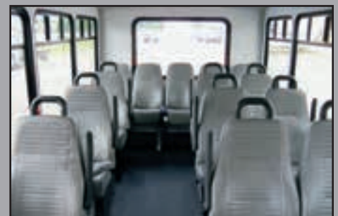
Optional 13 passenger capacity with mid back seats, top seat mounted grab handles and armrests