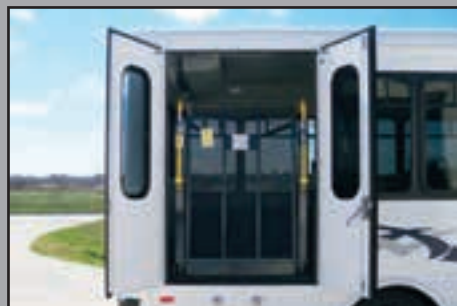
Optional double wheelchair door with top mounted gas shocks to hold door open in windy conditions