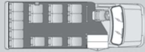
14 Passenger Plus Driver