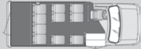
10 Passenger Plus Driver with Secure Rear Cargo Area