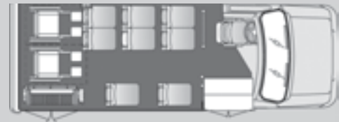
Lift System for Wheelchair Passengers, Plus 8 Ambulatory Passengers