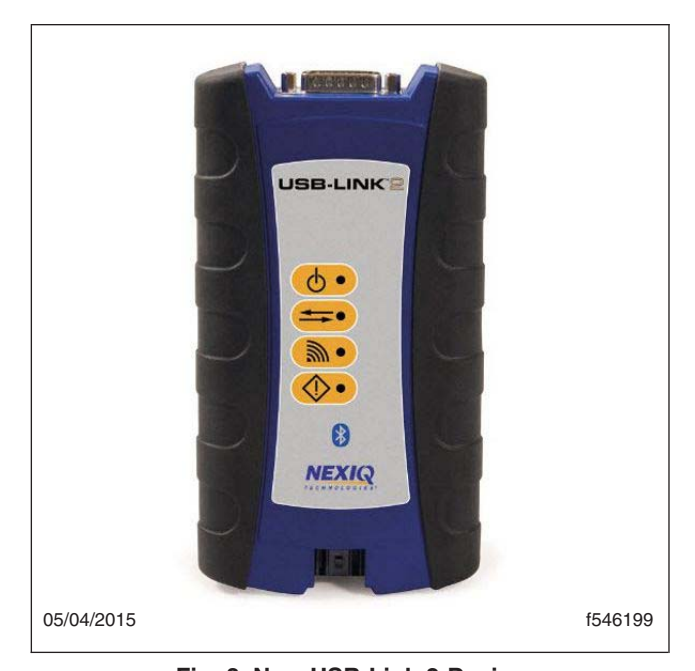
Fig. 3, New USB-Link 2 Device