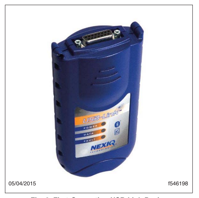
Fig. 2, First Generation USB-Link Device